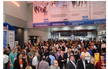
ISSA National Convention October 19th - 23rd 2015