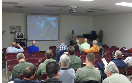
IPM State Coalition Meeting November 19th 2015

On November 19th, we attended the Semiannual State Integrated Pest Management (IPM) Coalition meeting held at Weber School District Facilities Training Center.