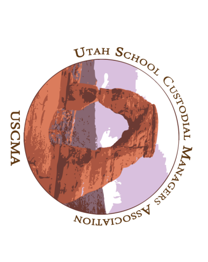
Syracuse High School - Address: 665 S 2000 W, Syracuse Utah, 84075 Please park on the East side of the building. USCMA 2016 Summer Conference, June 16<sup>th</sup> 2016 8:00 AM – 1:00 PM